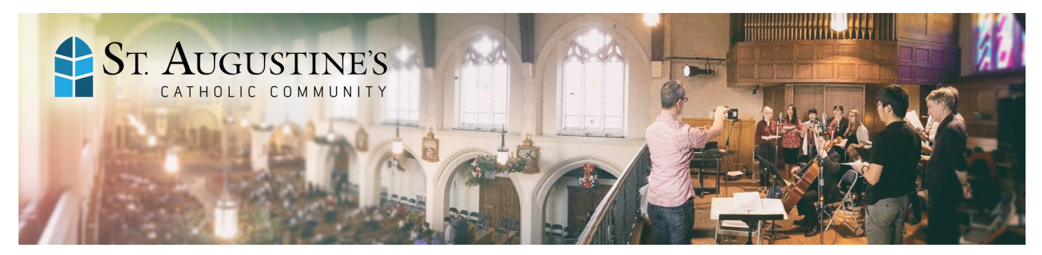
April 7th 2024 Second Sunday of Easter