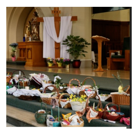
Easter Basket Blessing