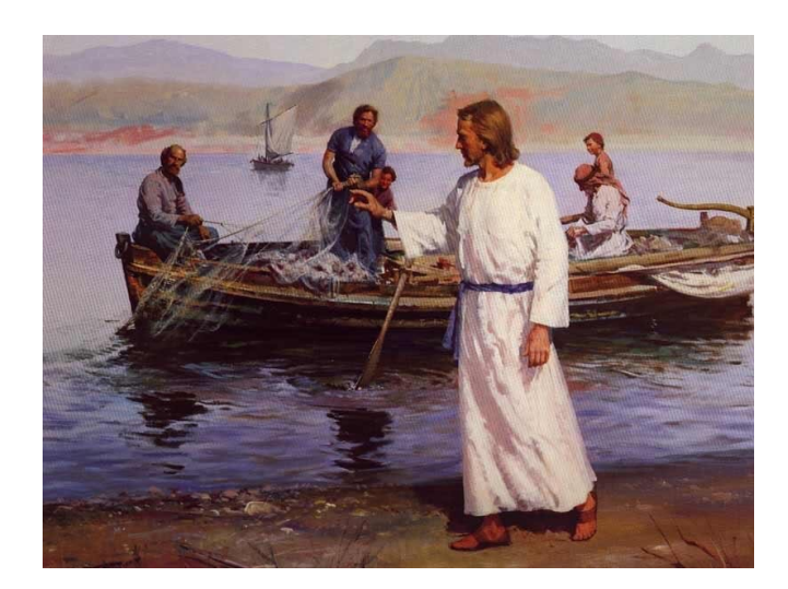
Repent and believe the Good News

The first half of Mark's Gospel describes Jesus' ministry of healing and preaching in Galilee.