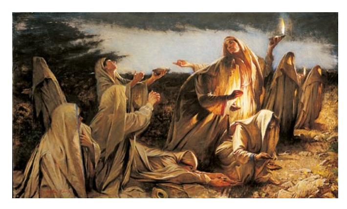
Parable of the Lamps

The first reading eulogises wisdom. We see this wisdom exemplified in the five bridesmaids in the Gospel parable.