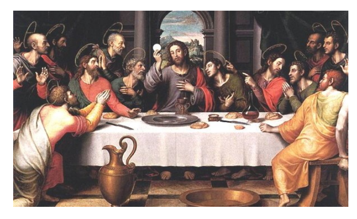
The Body and Blood of Christ

The theme of covenant dominates all three readings. The reading from Exodus describes the ratification of the Sinai covenant between God and Israel. The covenant was sealed with the blood of the animals. Blood is a symbol of life which belongs exclusively to God. The sprinkling of the people with blood symbolizes the fact that God is sharing his life with them.