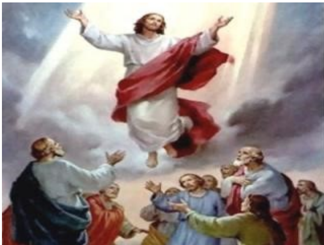
Ascension of the Lord

The resurrection, the ascension, and the giving of the Spirit are part of the same event. In one action that goes beyond earthly time, Jesus emerges from the tomb, returns to the Father, and gives the Spirit. However, from the viewpoint of the first disciples, who continued to live on within time, these actions are described as having taken place at different times: They found the tomb empty on Sunday morning; the risen Lord appeared to them on that day or subsequently; the termination of the appearances caused them to realise that Jesus was now permanently with God; and they received the Spirit.