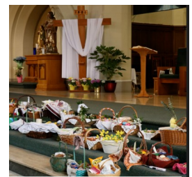
Easter Basket Blessing